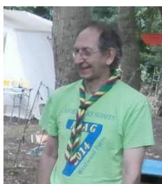
Scout Leader Join Leadership Team

Manager@Halsteadscouts.org.uk 01732 465062 07786 298297